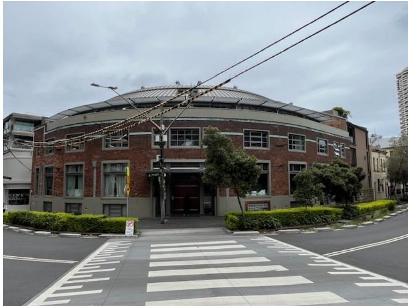
Figure 1: 48-50 Stanley Street, Darlinghurst viewed from the south-west